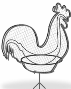
Wire toys and puzzles